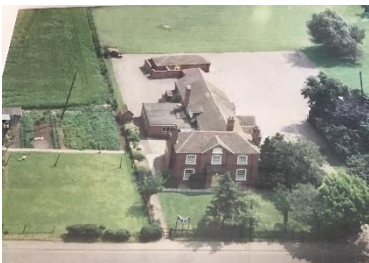
Ariel photo of our school in 1980.

We will start to look at maps. The children will make a map of Welly Walk.