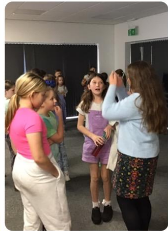
Happy Diwali We had a wonderful whole school Diwali Day.