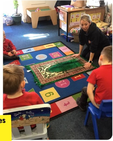
We have been learning about Mosques and why they are special to many Muslim people. 28/2/25