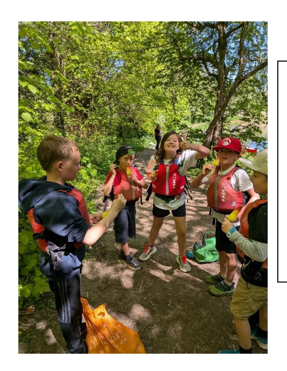
Willow Class had a fantastic day out Bellboating on Wednesday