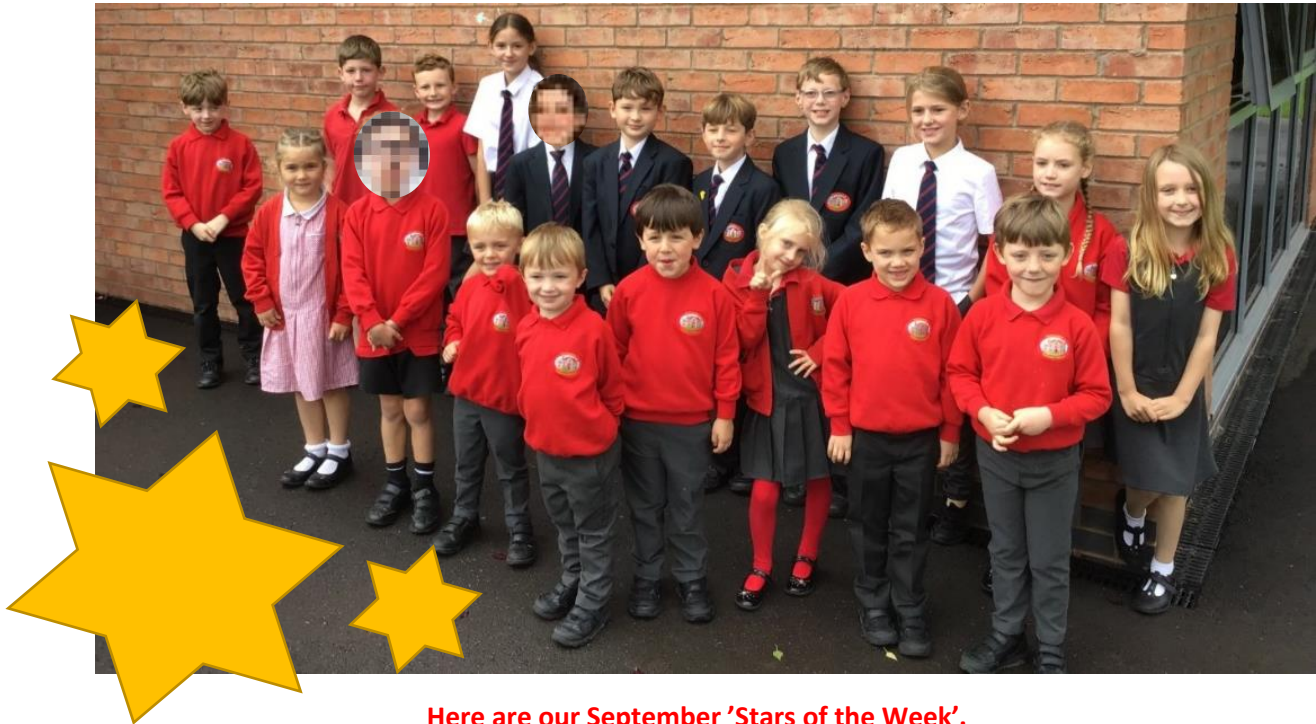
Here are our September 'Stars of the Week'.

These are the children that teachers have picked out this month for congratulations. They have shown a wide range of characteristics and skills from resilience to kindness, excellent learning behaviours and being great role models. Well done to you all - keep up the hard work! We are looking forward to meeting our October Stars through this month's assemblies.